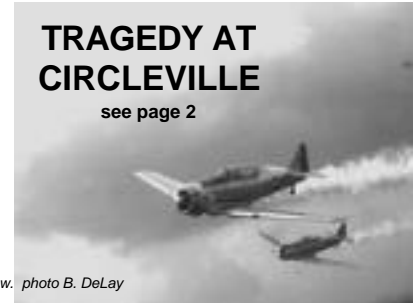
AT-6's over Wings of Victory airshow.