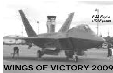
WINGS OF VICTORY 2009

New airshow committee is up and running with several people working to explore new ideas for marketing and finding sponsors. Several people on the committee are filling the responsibilities of the past chairpersons. At the November membership meeting it was agreed that the committee needs to set forth plans that will increase sponsorship, explore HAS doing a food vendor function and identify ways of lowering our costs. Once this is submitted to the Board a decision will be made by February as to whether to commit to a show in August. Without this firmly in place it would be too risky to do the show. Stay tuned by attending the next Membership meeting!