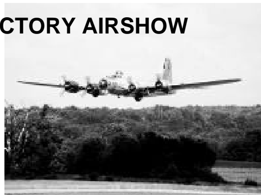
B-17 flyby at 2000 Wings of Victory

As you may have noticed publicity for the event is beginning to appear. Watch for your July issue of Country Living magazine to catch the full color story about the A-26 and a notice of the Wings of Victory airshow.