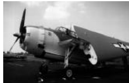
Wings of Victory 2000