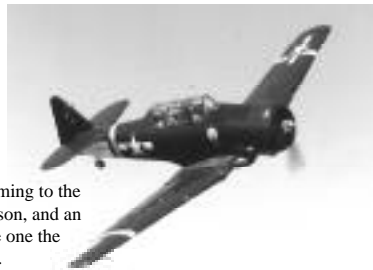
Additional planes coming to the show are an L-5 Stinson, and an A-26 Invader like the one the squadron is restoring.