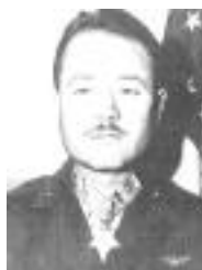
left-Gregory 'Pappy' Boyington with Medal of Honor.

recently passed away. Lancaster Visitors Bureau is assisting with a poster for the air show.