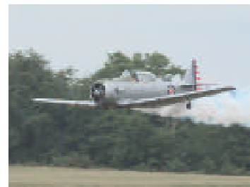
right-SNJ lays down smoke at 2000 Wings of Victory